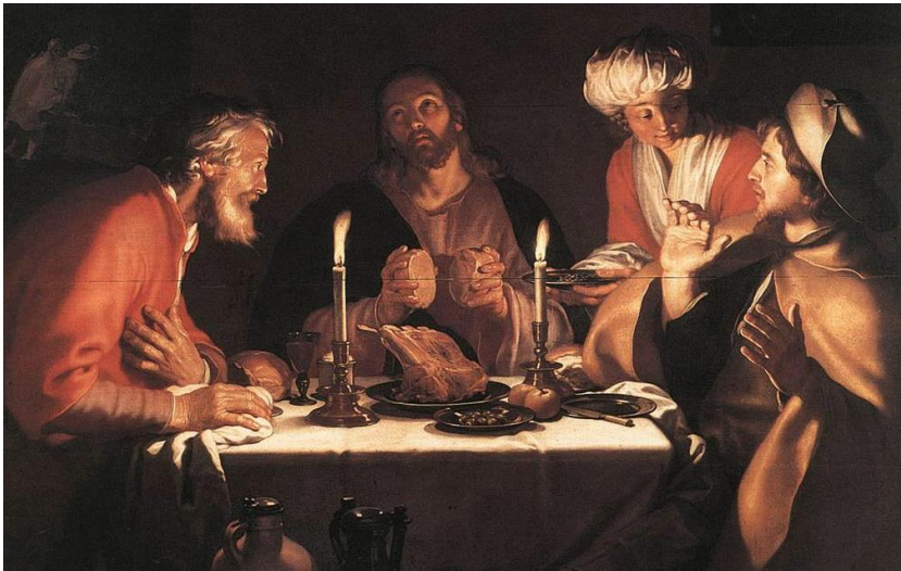
Jesus breaking bread with two disciples on the Road to Emmaus.

The same is true with Jesus. If we want to develop and deepen our relationship with Him, we must take the time and effort to open our hearts to Him. Otherwise, we run the risk of knowing about Him but never really knowing Him. Prayer is the way we develop and deepen that heart-to-Heart connection with Jesus. A life of prayer is the only way to truly come to know Jesus.