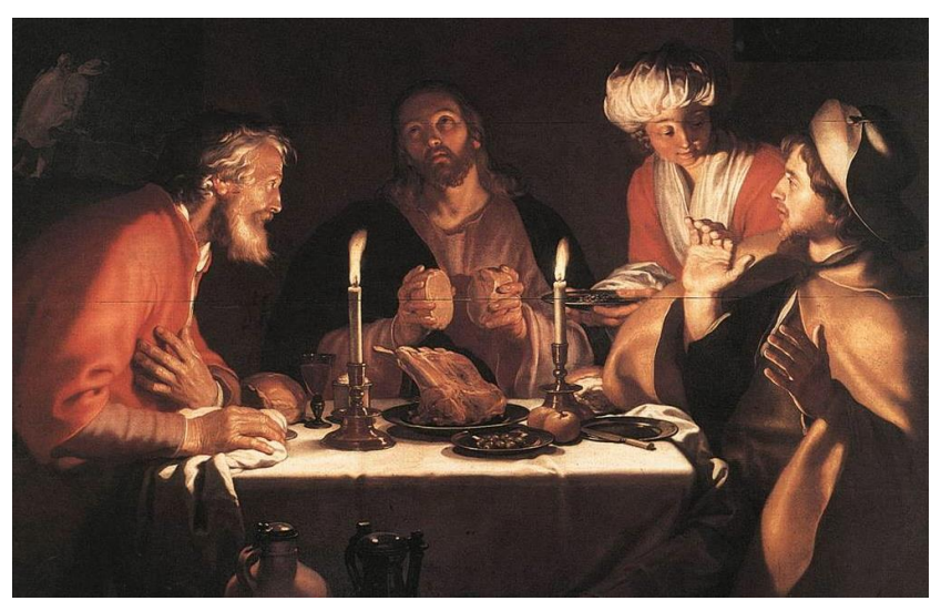
Jesus breaking bread with two disciples on the Road to Emmaus.

The same is true with Jesus. If we want to develop and deepen our relationship with Him, we must take the time and effort to open our hearts to Him. Otherwise, we run the risk of knowing about Him but never really knowing Him. Prayer is the way we develop and deepen that heart-to-Heart connection with Jesus. A life of prayer is the only way to truly come to know Jesus.